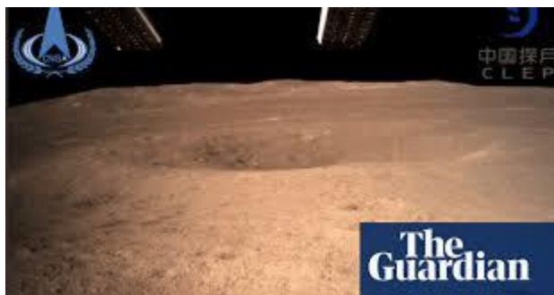
IMAGE TAKEN BY CHANG'E 4

THE FUTURE?? Unlocking the mysteries of the internal composition of the moon,local lunar geology.