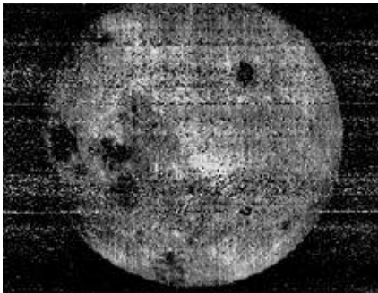
taken on 7 th October,1959